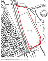
LOCATION PLAN SCALE 1:2000